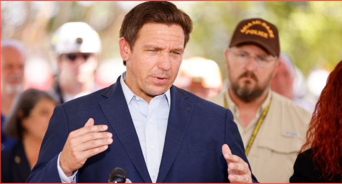
Florida Governor Ron DeSantis presents his thoughts on legislation to provide the Executive Branch with a large emergency preparedness fund at a press conference this week.

ENVIRONMENT The first plans for the $100 million allocation Statewide Flooding and Sea Level Rise Resilience within the Resilient Florida program established under SB 1954 , (2021) were presented in committee on Tuesday evening, where members were somewhat concerned about the selected projects. Three hundred and eighty-four applications were submitted, of which 275 were technically eligible for funding and 76 were selected for inclusion in the Department of Environmental Protection's (Department) initial plan. Of the selected projects, members expressed concern that smaller community's requests were overlooked and perhaps the Department's approach is misguided. Another $500 million is recommended for resiliency projects under Governor DeSantis's Freedom First Budget.